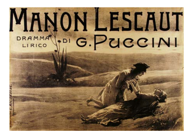
Manifesto di Vespasiano Bignami per la prima assoluta di Manon Lescaut di Giacomo Puccini, 1893\,